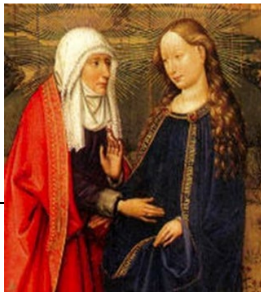
The babe leaped in her womb - Luke 1:41

Lead us, including mothers of the unborn, through inspirations given us by Jesus, the Holy Spirit, Mary, and our guardian angels, leading us to works of mercy done for people of all ages, from conception to natural death, from unborn babies and their mothers to the elderly and dying, as we work under the protection of Saint Joseph, our spiritual father and terror of demons.