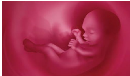
as you did it not to one of the least of these, you did it not to me - Jesus Christ (Matthew 25:45)

As "us" means all of us in the body of Christ, so we forgive* those who sin against our unborn sisters and brothers, praying for the conversion of their mothers and all who fail to defend these babies.