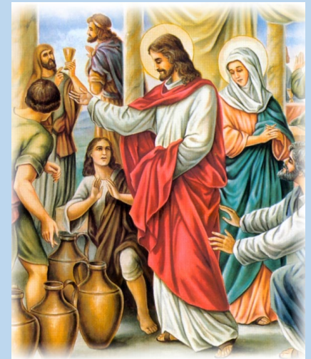
The Miracle at Cana: The finest wine was created when men acted on Jesus's word.

Last, but not least, in the 20th Century, A.D., Jesus told Saint Faustina, "Even the strongest faith is of no avail without works.... If a soul does not exercise mercy somehow or other, it will not obtain My mercy on the day of judgment."